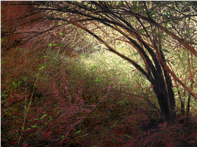
Painting at left: "Underbrush"