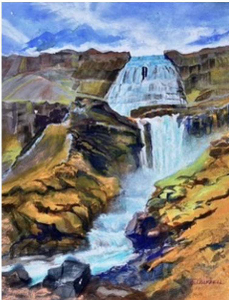
Dynjandi Falls, Iceland, Watercolor