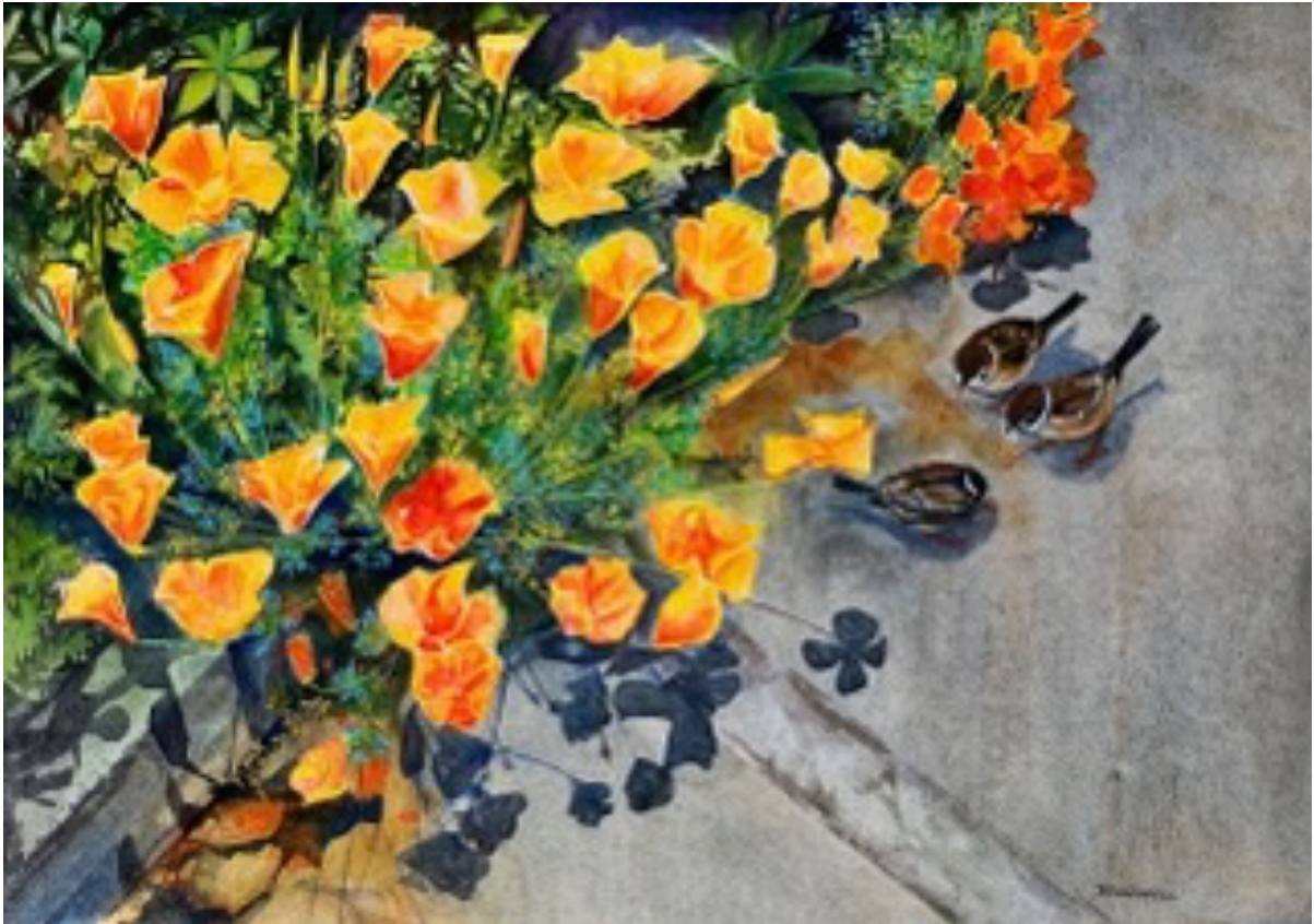
Curb Side Service , Watercolor, acrylic pen

I love discovering the endless possibilities.